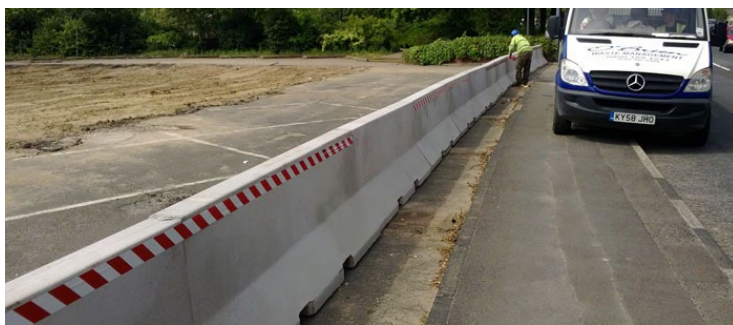
Barrier blocks can be interlocked to form a continuous wall